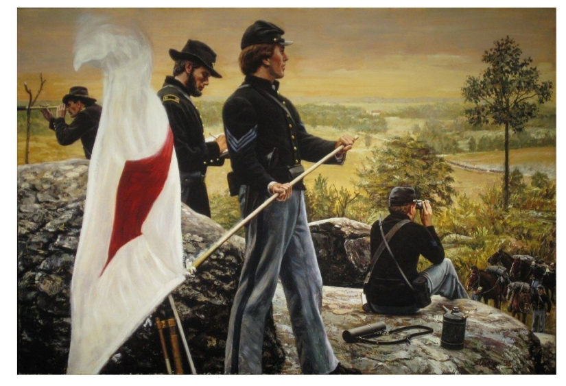
Signals from Little Round Top, A painting by Don Stivers

On the last day of The Great Gettysburg Reunion of 1913, thousands of visitors boarded trains and got into their automobiles to head home. About one hundred veterans stayed behind. They were members of the now well established Signal Corps. There were two Signal Stations set up; One on Little Round Top; The other on Seminary Ridge. These men, who were a combination of Confederate and United States Veterans, proceeded to send messages across the fields using their signal flags just as they had done 50 years before. The final line that wig-wagged across the fields that afternoon: